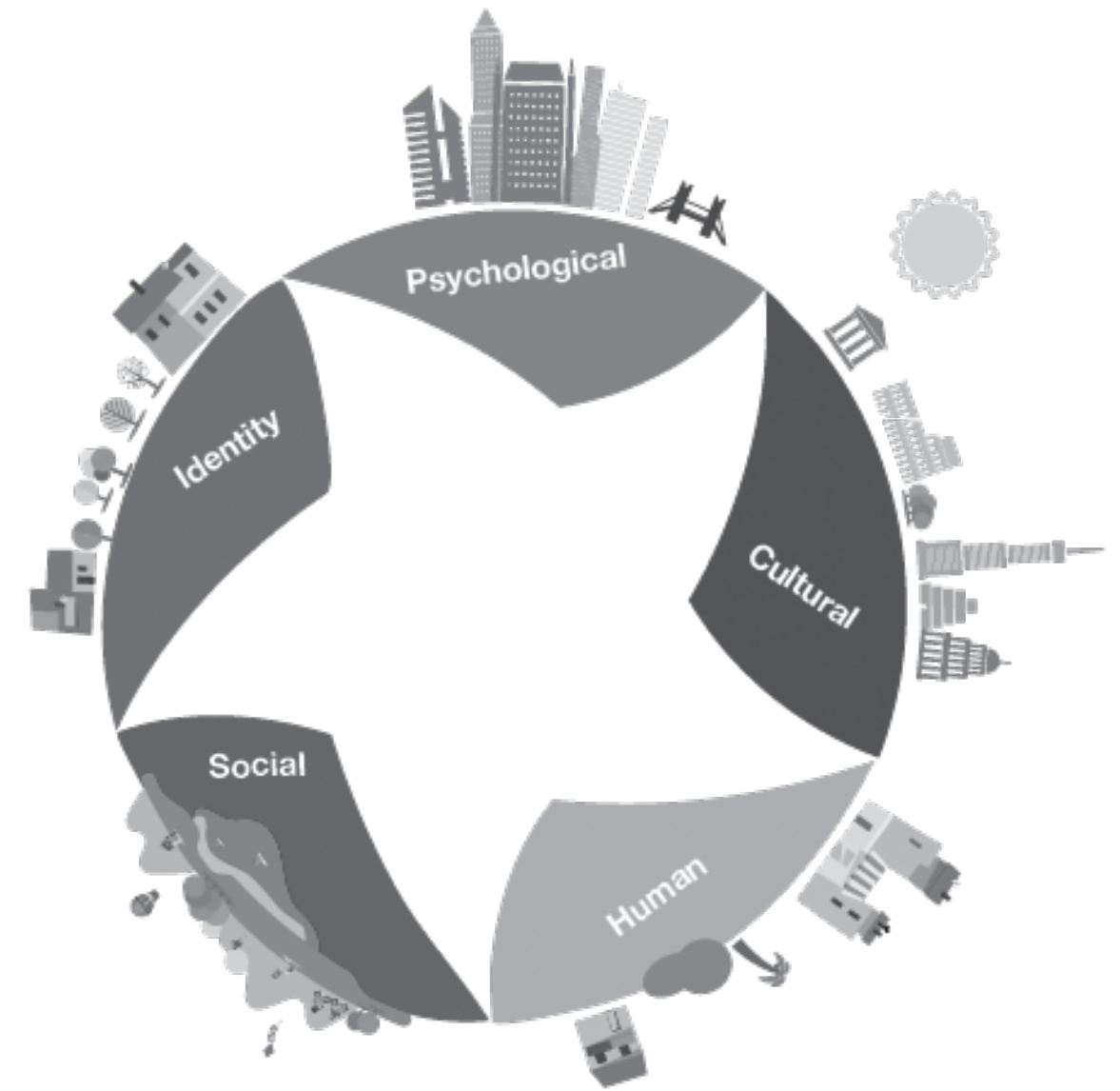
Figure 1. Graduate capital model

Psychological capital is potentially significant for helping graduates more proactively adapt to the challenges of a changing and fluid professional labour market.